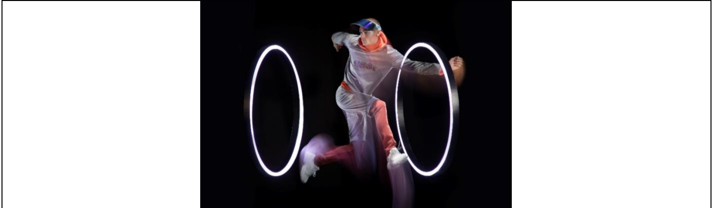
Caption: Design created by SCAD Hong Kong fashion students, as part of the SCADpro project sponsored by The Walt Disney Company